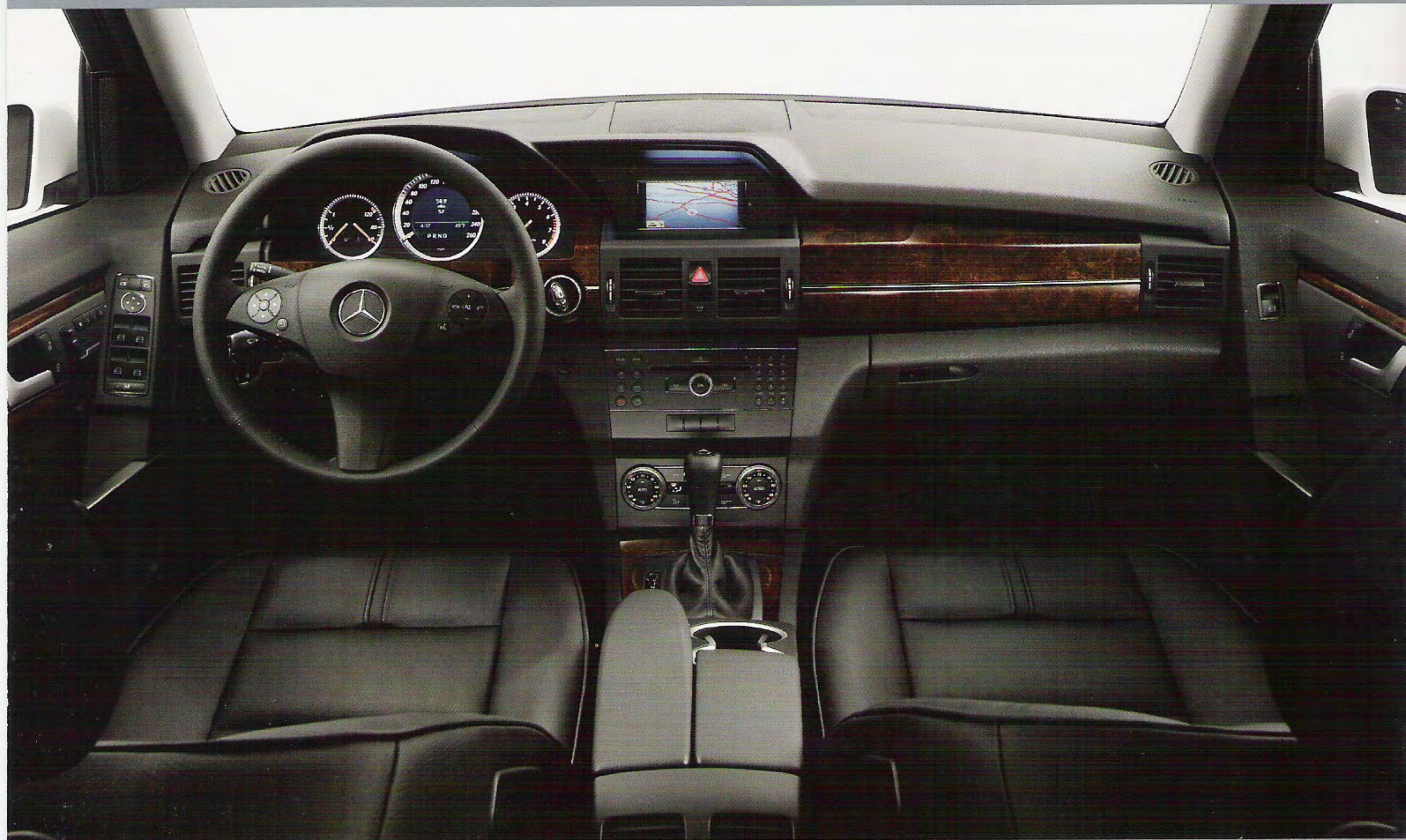
GLK 350 shown with optional Black leather interior, Burl Walnut wood trim, and optional Multimedia and Premium 2 Packages.